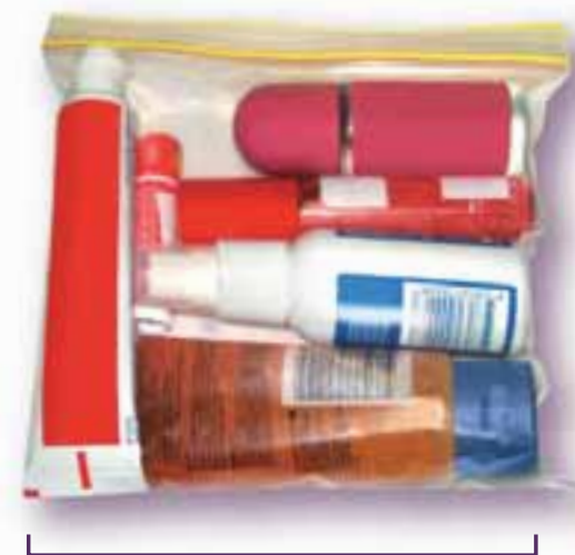
Size about 20 x 20cm